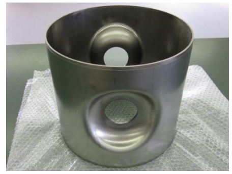
Figure 3: Body part.

Body part (see Fig. 3) around beam port is dented. This part is made by forming. The forming jig was designed based on the forming simulation.