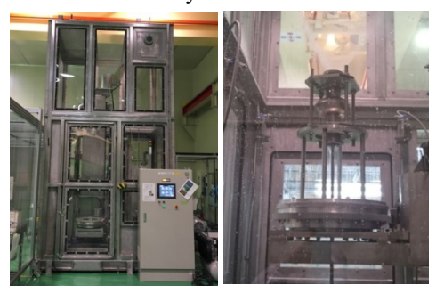
Figure 6: High pressure rinse facility.

Superconducting RF cavity is high pressure rinsed with ultra-pure water. Outline and specification are shown in Fig. 6 and Table 3. This facility has 4 axes movements.