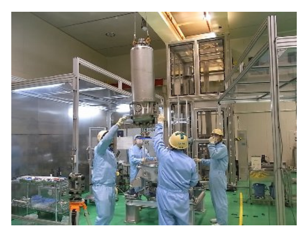
Figure 8: Heavy parts are brought into clean room using crane. Workers are wearing ISO7 clean ware.