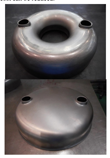
Figure 4: Top and bottom.

Top and Bottom parts are made by deep drawing method from niobium disk. (See Fig. 4) Forming of top part needs six or more steps. Nozzle part is made by burring because the shape of a connecting port part can became simple and the total cost can be reduced.