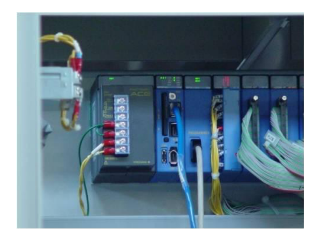
Figure 2: F3RP61 in operation.