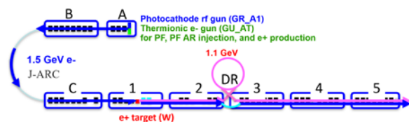
Figure 1: Schematic layout of the SuperKEKB injector linac. It comprises two straight sections of 120 m and 500 m long. They are connected 180 degree bending section. The both electron sources of thermionic and photo cathode rf gun are situated at the most upstream end of the injector linac.

section is decreased from 1.7 GeV to 1.5 GeV since the main ring energy of electron is changed from 8 GeV to 7 GeV. It is effective for grabbing a standby klystron in SectorA and SectorB. For the SuperKEKB injector operation, the most challenging issue is the high bunch charge transportation of low emittance beam. It is strongly required to the nano-beam scheme operation of the main ring for getting the high luminosity. For the high intensity positron generation, the flux concentrator and 10 large aperture S-band accelerating structures have been manufactured and installed into the beam line. As a low emittance and high intensity electron source, we have developed and installed a new photocathode rf gun cavity based on a noble new scheme in the summer of 2013. In addition, a new laser system has been also developed and worked well [4].